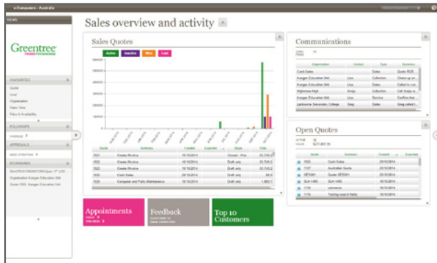
The Views Tray can be instantly resized when you want to see more information and just as easily pushed closed, when you don't.