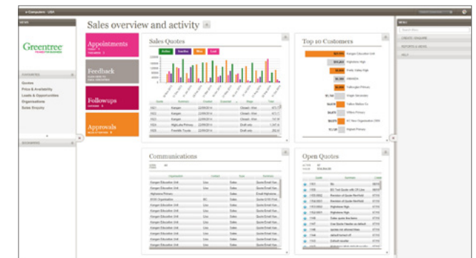
Know what's happening in a glance: Workspace showing badges and four open panels.

need to keep at hand. Choose to present the information as a badge or load into the Views Tray to keep in constant view (check out the Workspace video for more on this). The badges highlight key facts such as overdue tasks and alerts across a comprehensive range of intelligence.